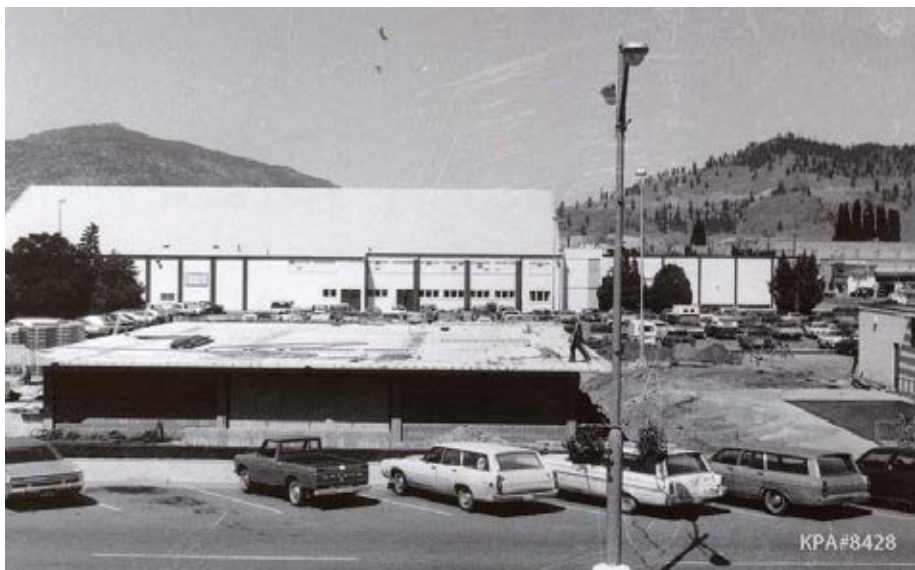
The Kelowna Centennial Museum under construction.

On June 10, 1967, during Canada's Centennial celebration, dignitaries cut the ribbon on Kelowna's first purpose built museum on the corner of Queensway and Ellis. A second level was added in 1976 to accommodate an archives, more display area, and programming. Over the years, the name changed from Kelowna Centennial Museum to Okanagan Heritage Museum.