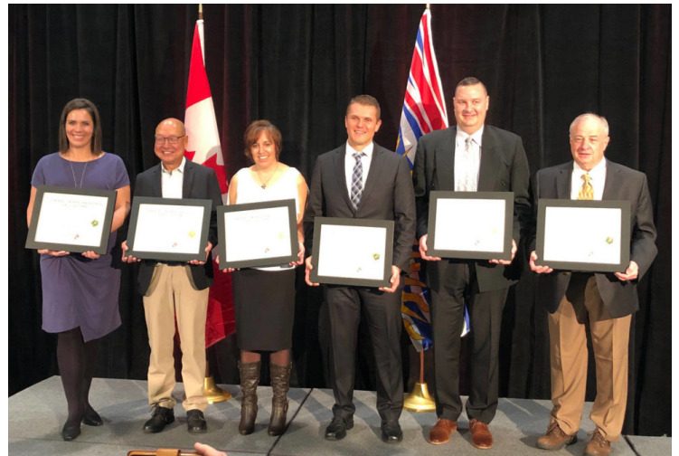
2018 Induction Ceremony