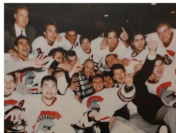
1993 KELOWNA SPARTANS